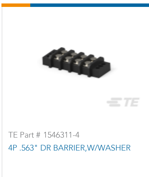
TE Part # 1546311-4 4P .563\"/>